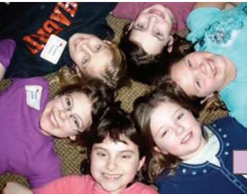
A circle of friends

GROUP for high school youth J.O.Y. for junior high youth Confirmation Classes Colorado Faith Journey Work Camps Guitar Choir Youth Shepherds Praise Band