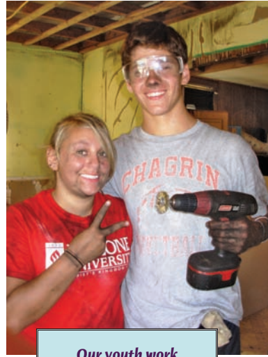
Our youth work campers rebuilding lives in West Virginia

We share this ever-shrinking globe with others who need our gifts. From our neighbors at Chagrin Falls Park to far off communities in our country and abroad, Federated gives generously of its time, talent, and treasure. Your pledge directly supports mission partners chosen by the Board of Mission and Outreach. Additionally, your generosity supports our Bell Street and Family Life Center facilities, providing meeting and work space for many worthy organizations.