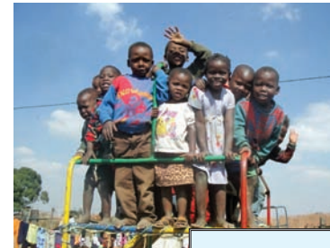
The children at Sparrow Village in South Africa