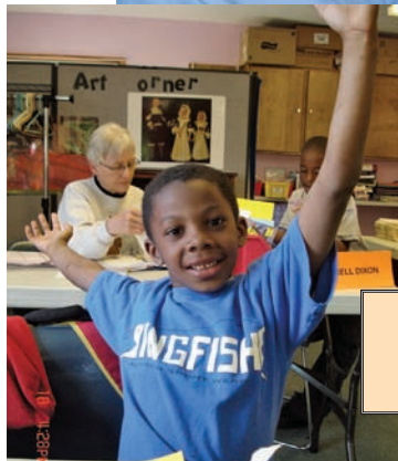
Tutoring at Chagrin Falls Park Community Center