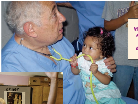
MedWish saving lives & the environment through the recovery & recycling of donated medical supplies