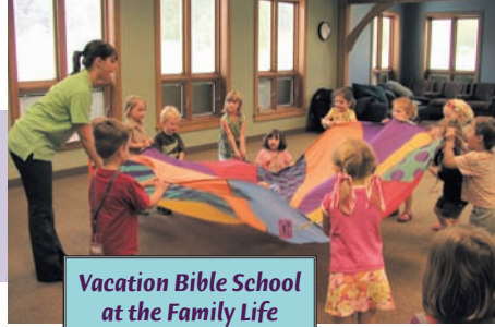
Vacation Bible School at the Family Life Center

Federated uplifts, educates, and guides our young people through their faith journey. Opportunities are offered for children of all ages to learn and grow together. The youth of Federated are blessed with amazing staff and leaders, a wide variety of programs and curricula, and the facilities and supplies needed to make their spiritual education fun and transformative.