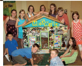
The church school children collected coins for MedWish International