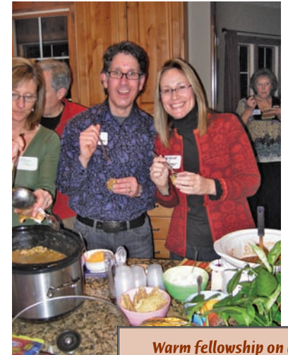
Warm fellowship on a cold evening at the What A Life! Chili Cookoff

Elderlife What A Life! - Youth Group for Grownups Federated Women's Network Women's Retreats Women at the Well Men's Fourth Tuesday Gathering of Men Men's Retreats and Breakfasts Sit & Stitch Needlework Group Spirit Walk & Roll Support Groups