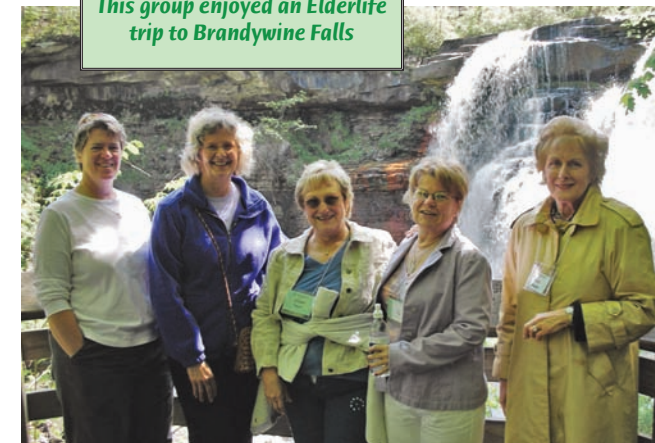
This group enjoyed an Elderlife trip to Brandywine Falls

Social Justice Committee Green Committee