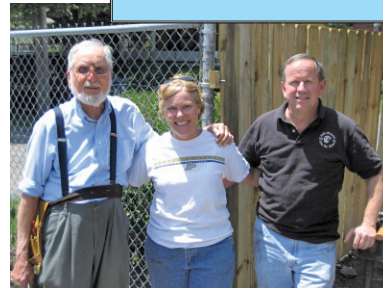
Federated folks helping at St Paul's Community Church on the near westside