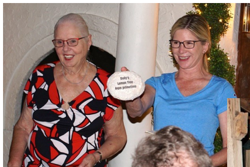
Dolly's Goodbye Party