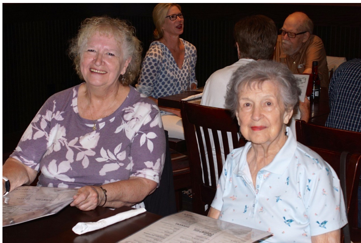
Lunch Out at The Rusty Bucket