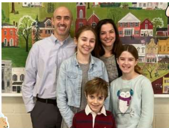
The Wright Family