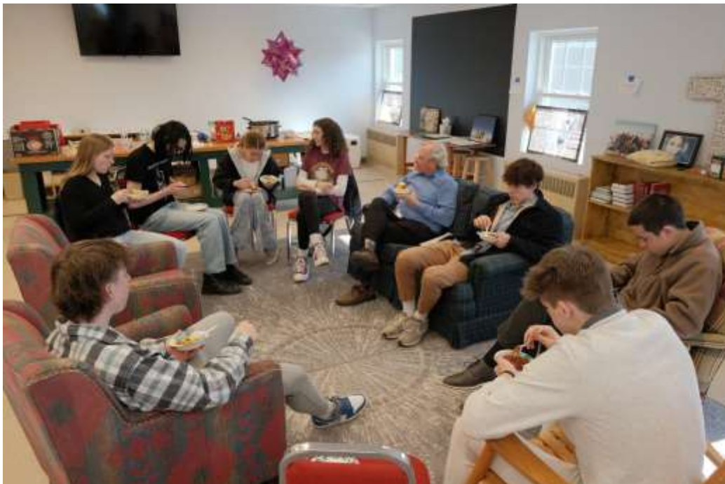
Comfortable Confirmation Discussions in the Youth Room.