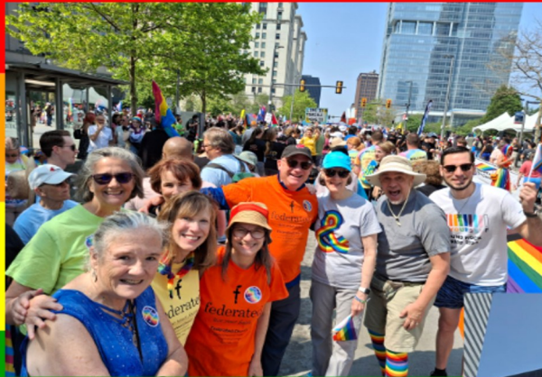
Celebrating @ CLE Pride 2025