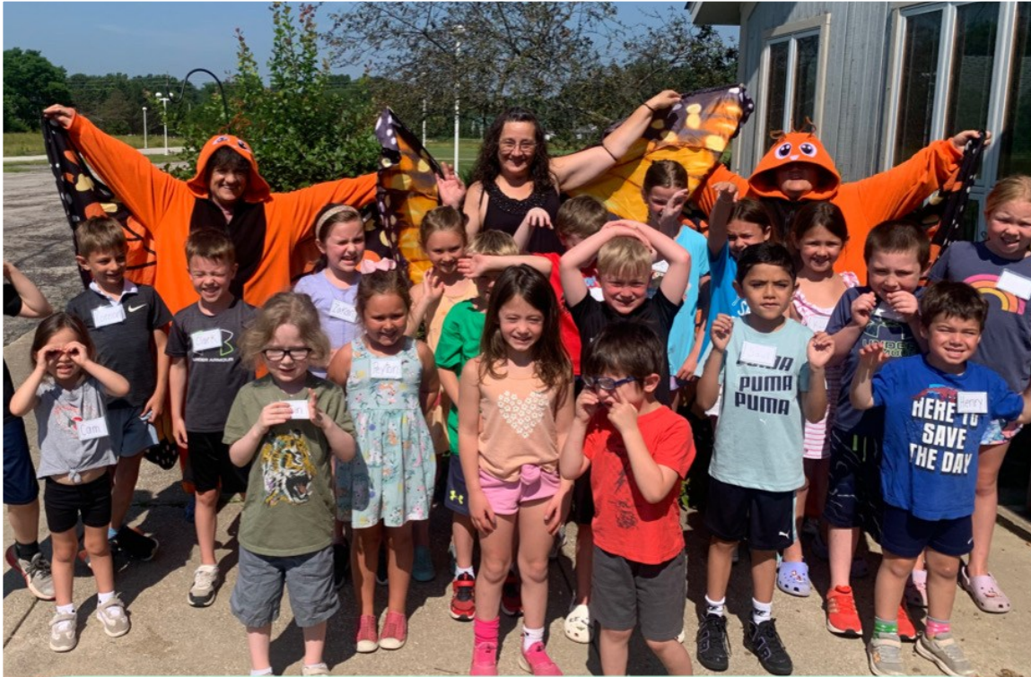
Vacation Bible School 2025